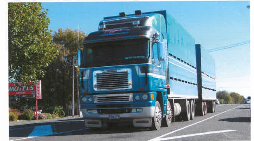
The New Zealand Livestock Transport Assurance Programme creates a single assurance programme used by most of the major processing companies

Other advantages are that the NZLTA incorporates the Forum's and the Ministry of Primary Industries' electric prodder guidelines and acknowledges the Occupational Safety and Health benefits of responsible prodder use. The NZLTA also increases support for the Forum's Stock Crate